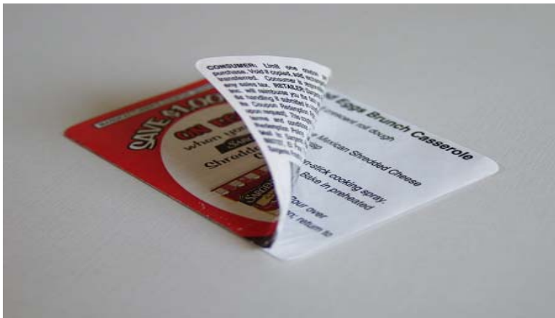
ApPeels creates an IRC with a recipe