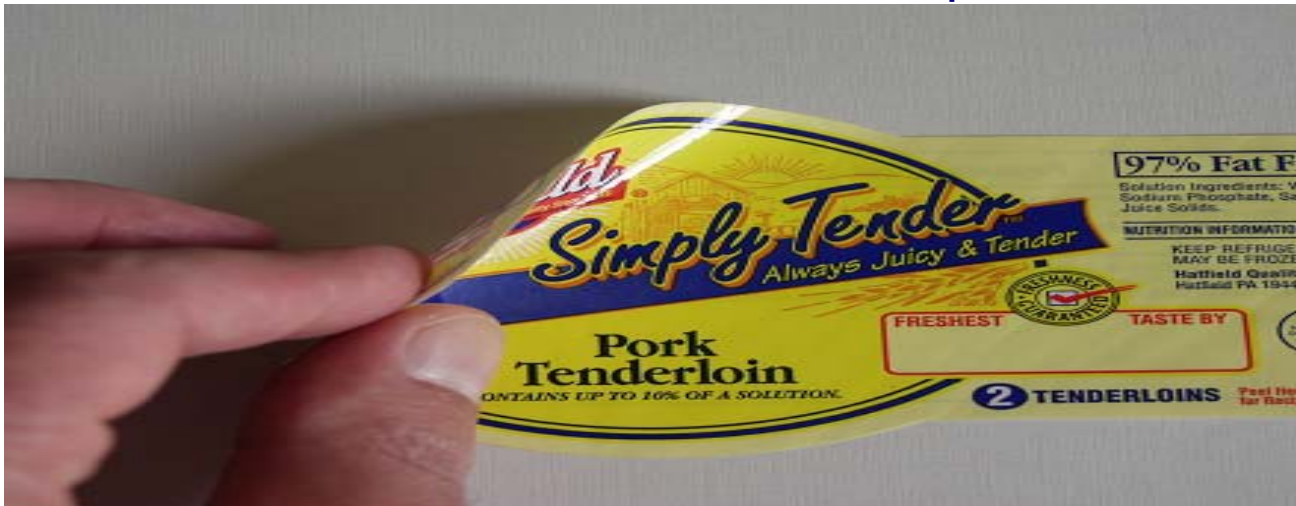
Use ApPeels to reveal cooking instructions on a clear base