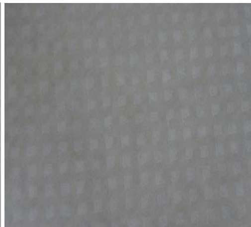
Peel-Anywhere pattern ensures a Perfect peel for cards and labels